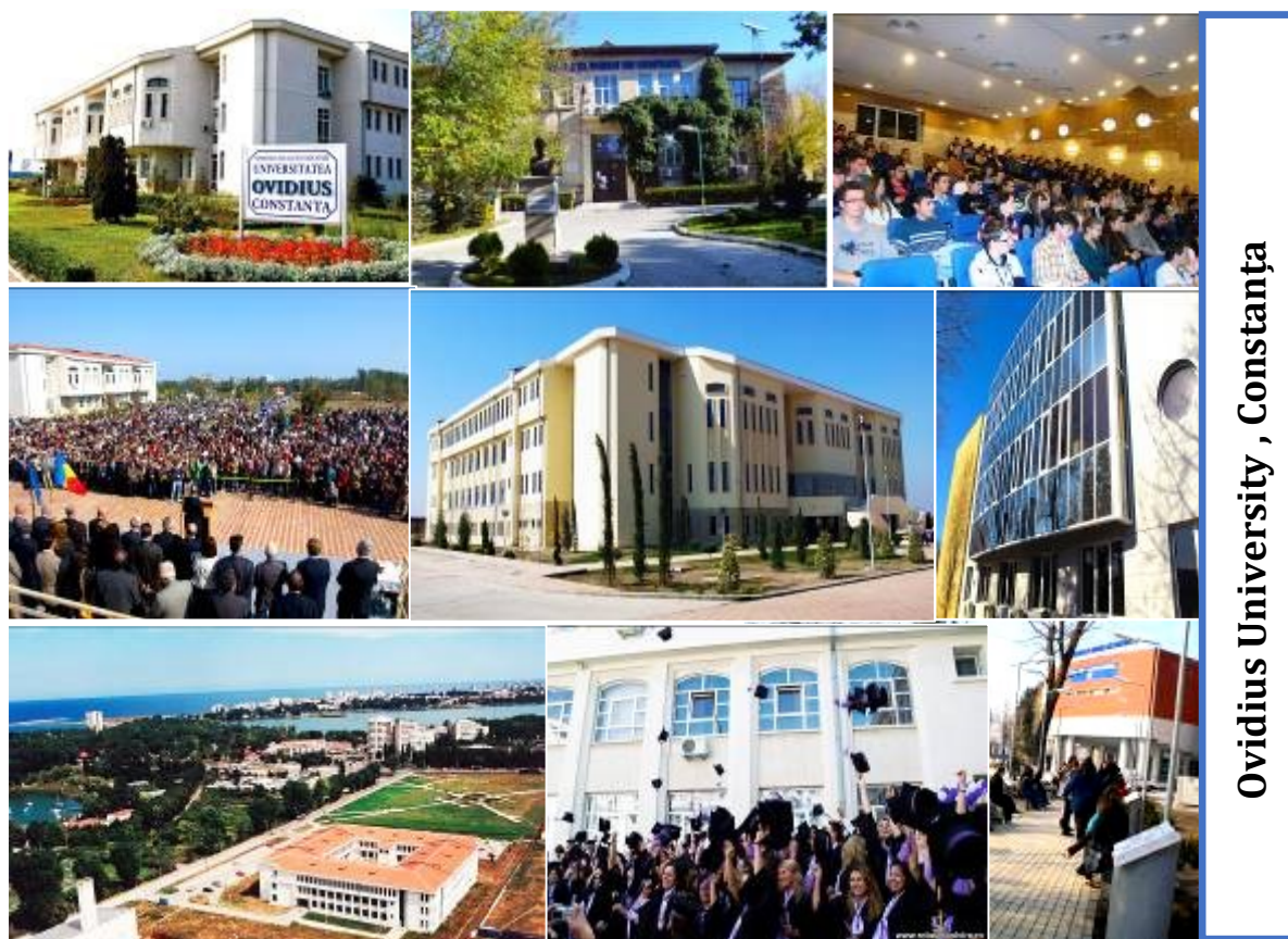
Ovidius University , Constanța

Ovidius University (Constanța, Romania), a modern and vibrant research university on the Black Sea coast, welcomes dialogue-oriented researchers and practitioners to the 3rd ESTIDIA conference, to be held on 25-26 September, 2015. The conference serves as a discussion forum for researchers and practitioners to showcase their dialogue-oriented work on current societal and community-related issues, and on methodological approaches to dialogue analysis. The aim is to bring together senior and junior scholars and practitioners from a wide range of disciplines and professional orientations to critically explore, through dialogue, different perspectives on human thinking, communication strategies, interpersonal relations, socio-cultural traditions, political processes and business interactions by means of theory-based and practice-driven investigations.